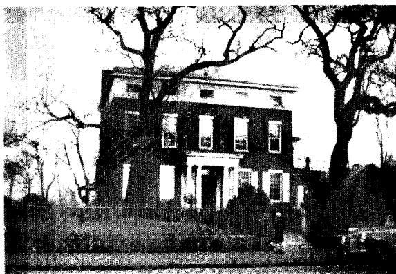
Photograph of the Grubb Mansion about 1948 before the fences, outbuildings and distinctively Victorian landscaping were leveled. The structure now serves as the headquarters for the Lancaster Recreation Association.