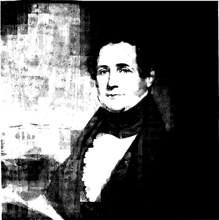
Thaddeus Stevens at thirty-eight from a painting by Jacob Eichholtz.

was not the intent of its framers,—despite Senator Conkling's later comments.