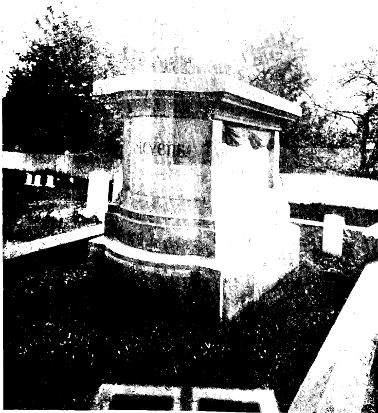
Thaddeus Stevens' tomb, Shreiner's Cemetery. Stevens Epitaph:—I repose in this quiet and secluded spot, not from any natural preference for solitude, but finding other Cemeteries limited as to race, I have chosen this as my last resting place, that I might illustrate in my death the principles I advocated through a long life, "The equality of man before his Creator."